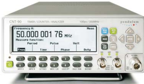
Figure 2: Measure function selection menu, shown with measured results.