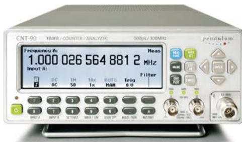
Figure 3: Input parameter setting menu shown with measured result.