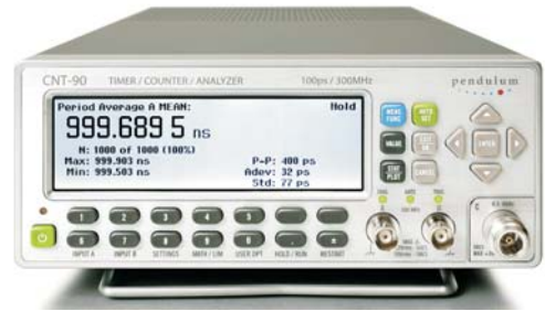
Figure 4: Display showing different statistical parameters viewed at the same time.