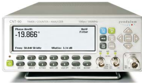
Figure 1: Display showing phase value, frequency, attenuation V_A/V_B , and auxiliary parameters.

When adjusting a frequency source to given limits, the graphic display gives fast and accurate visual calibration guidance.