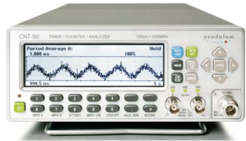
Figure 5: Display showing the trend (signal over time) of sampled data.