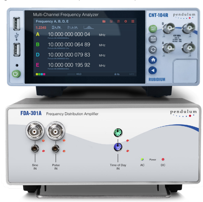
The FDA-301A distribution amplifier extends the number of 10 MHz outputs, up to 12

The CNT-104R comes as standard with one 10MHz reference output with ultimate frequency accuracy to 1 \times 10^{-12} , 24h average, using the optional integrated GNSS disciplining of the Rubidium clock. The addition of an FDA-301A Frequency Distribution Amplifier multiplies the number of outputs that can be distributed to 4, 8, or 12, depending on the number of rear-panel installed output modules (1, 2, or 3).