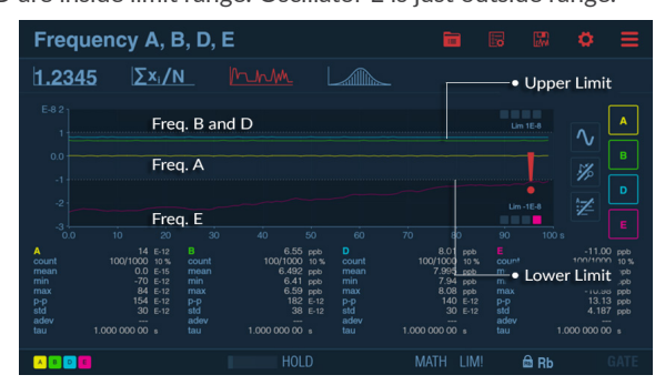
The time-line view reveals drift during the calibration

In the example below, three 10 MHz and one 5 MHz oscillators are tested in parallel, with tolerance limit \pm 0.1 Hz or 1x10^{-8} . Oscillator A, B, D are inside limit range. Oscillator E is just outside range.