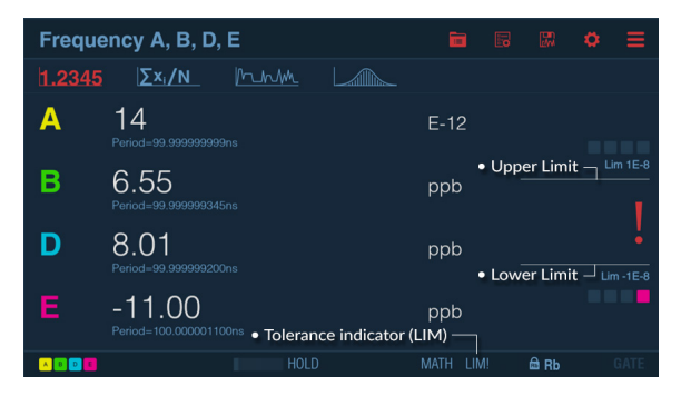
View 4 signals simultaneously on screen. 4 instruments in one!

Measured values are presented as both numerics and graphics. Graphical presentation of results (distribution, trends etc.) gives a better understanding of the nature of jitter. It also provides a much better view of changes vs time, e.g. drift. The same data set can be viewed in Numerical, Statistics, Distribution and Time-line views. It is very easy to capture and toggle between views of the same data set.