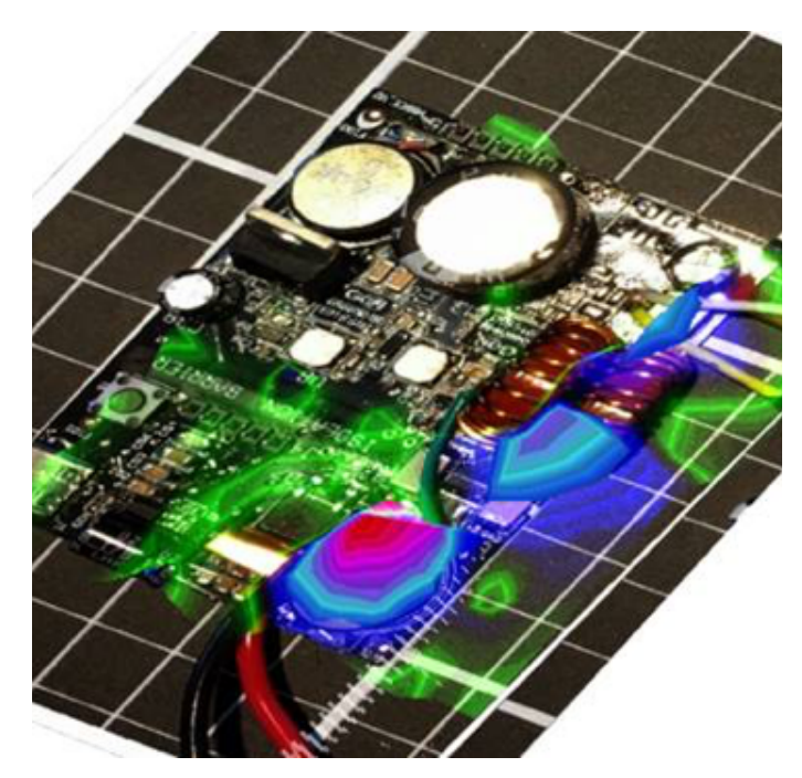
FIGURE 1. An overlapped 3D radiation pattern as obtained from the Detectus sw application.