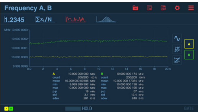
Compare 2 signals simultaneously on screen, with statistics parameters below. 2 instruments in one!

Measured values are presented as both numerics and graphics. The graphical presentation of results (distribution, trends etc.) gives a better understanding of the nature of jitter. It also provides you with a much better view of changes vs time, from slow drift to fast modulation. The same data set can be viewed in Numerical, Statistics, Distribution and Time-line views. It is very easy to capture and toggle between views of the same data set.