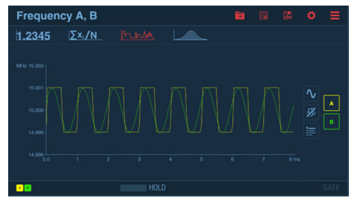
View fast FM, or any time/phase/frequency modulation, on screen, on one or two channels. Here we see FM modulation with both sine and square wave shape