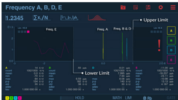
The Frequency distribution view reveals the spread (stability) of the oscillators

The limits can also be viewed in the frequency distribution display mode. The basic information is the same but this graph gives additional info.