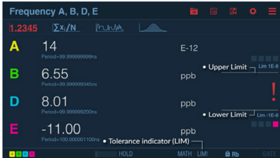
View 4 signals simultaneously on screen. 4 instruments in one!

Measured values are presented as both numerics and graphics. Graphical presentation of results (distribution, trends etc.) gives a better understanding of the nature of jitter. It also provides a much better view of changes vs time, e.g. drift. The same data set can be viewed in Numerical, Statistics, Distribution and Time-line views. It is very easy to capture and toggle between views of the same data set.