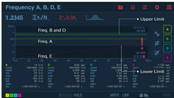
The time-line view reveals drift during the calibration

In the example below, three 10 MHz and one 5 MHz oscillators are tested in parallel, with tolerance limit \pm 0.1 Hz or 1 \times 10^{-8} . Oscillator A, B, D are inside limit range. Oscillator E is just outside range.